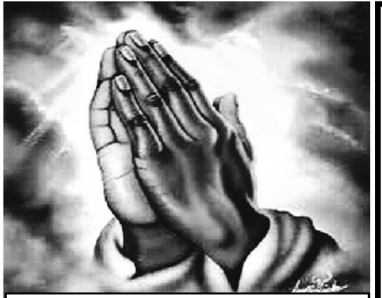
For Whom Shall We Pray...